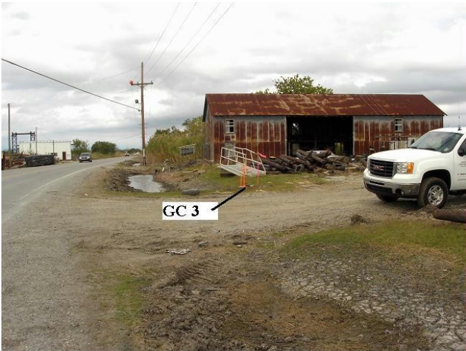
GC 3, AH6332, 3N, 20081112