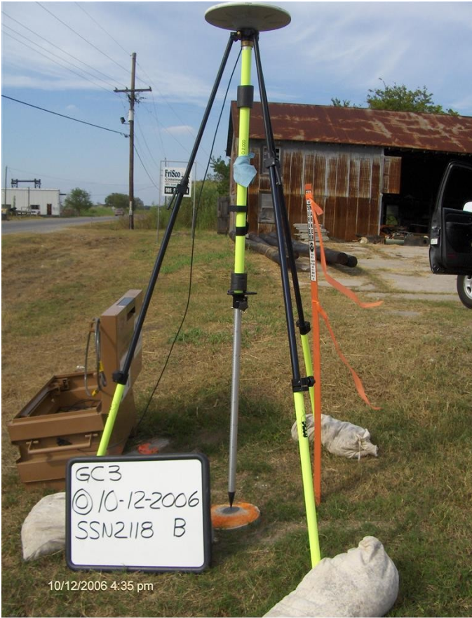
GC 3, AH6332, 3N, 20061012