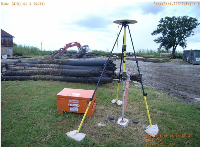
Side View (Looking East)