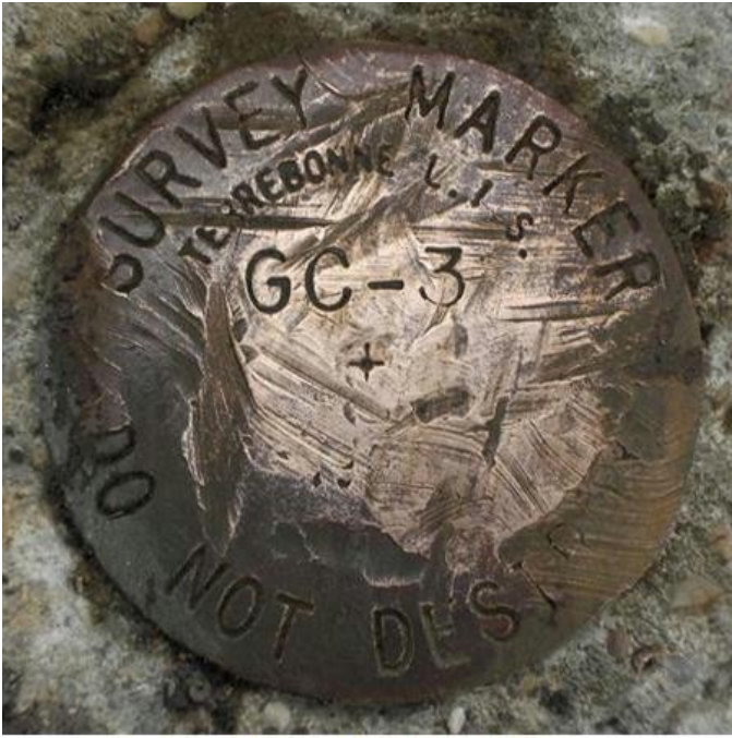
GC 3, AH6332, 1, 20081112