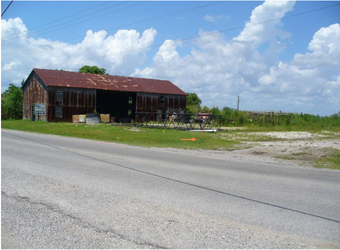
Side View (Unspecified)